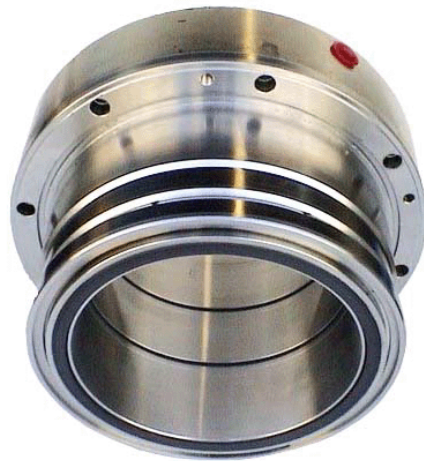
Carbon Bushing inserted on end of Seal