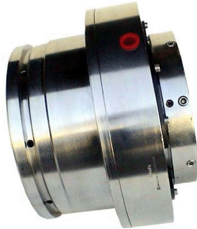
Repaired Durametallic Double Cartridge Seal for A Hymac Screw Impregnator